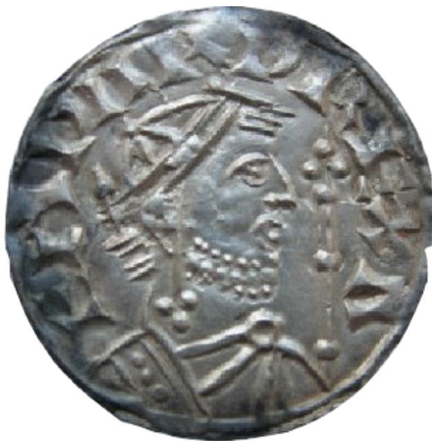
Edward the Confessor penny; Pyramids type, 1065-1066