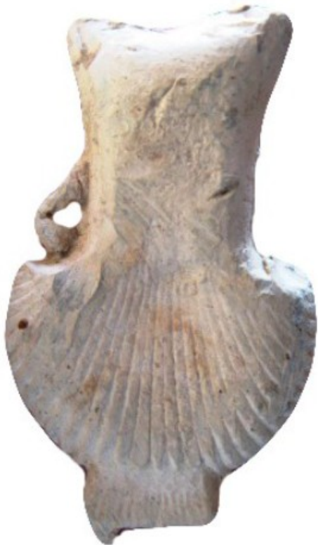
Pilgrims Ampulla By Tinner