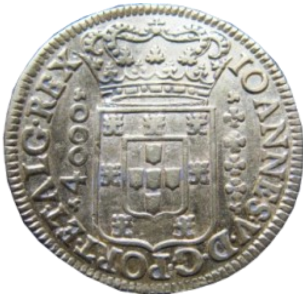
Joao V 4000 Reis Gold coin Tinner