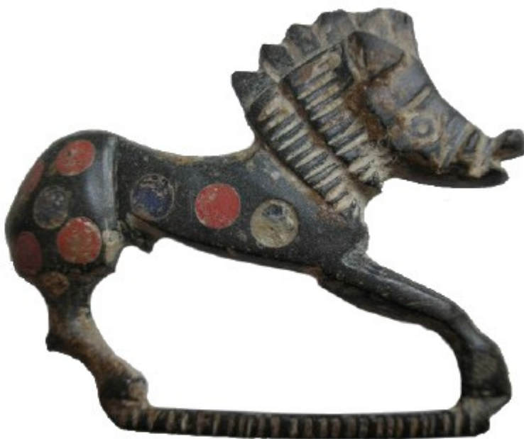
2nd century Roman boar brooch By Nickb