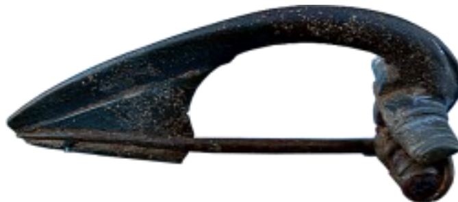
Roman Brooch Tinnorsdad