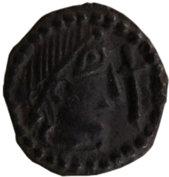
Series G A/S Sceat Mike1980